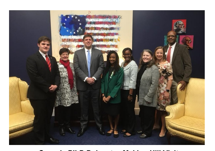
Georgia PILD Delegates Making Hill Visits