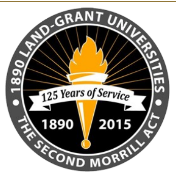
125 Years of Providing Access and Enhancing Opportunities

After reviewing the notes from last year's regional breakfast roundtables, I followed up with some of the land-grant universities to find out what they are specifically doing to encourage 1890 participation in their local chapters and what, if any, ideas they had for other states to consider as they reach out to their 1890 institutions.